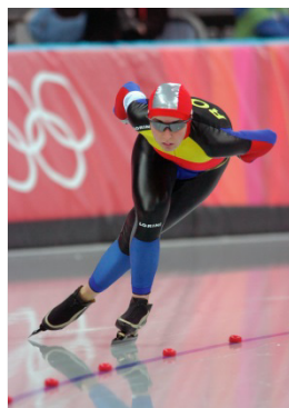
Turin 2006 1500m (W)