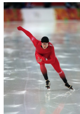
Sochi 2014 1500m (M)