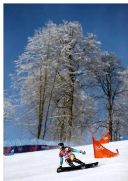
Sochi 2014 Parallel giant slalom (W)