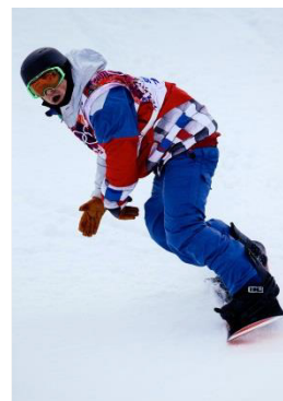
Sochi 2014 Half-pipe (M)