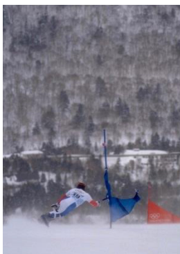
Nagano 1998 Parallel giant slalom (M)