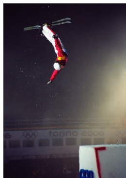
Turin 2006 Aerials (W)