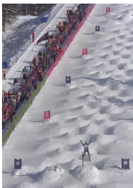
Lillehammer 1994 Moguls (W)