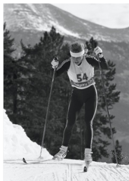
Calgary 1988 20km (W)