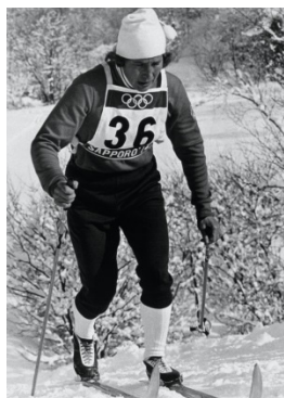
Sapporo 1972 10km (W)