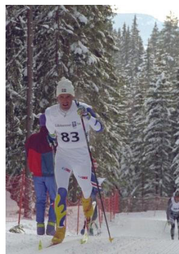
Lillehammer 1994 10km (M)