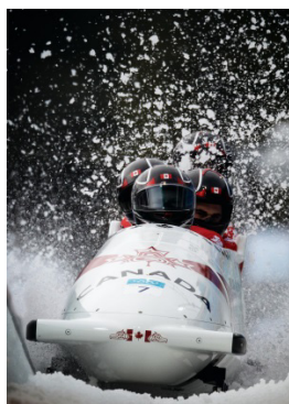
Vancouver 2010 4-man bobsleigh (M)