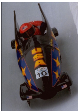
Nagano 1998 2-man bobsleigh (M)