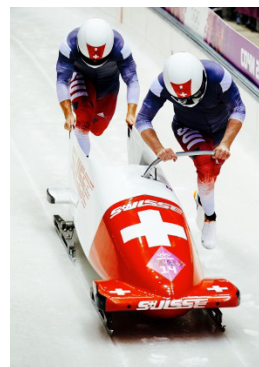
Sochi 2014 2-man bobsleigh (M)