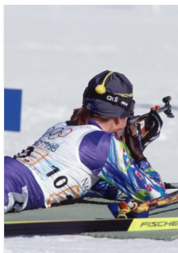
Nagano 1998 Relay (W)