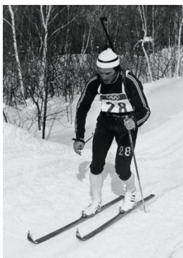
Sapporo 1972 20km (M)