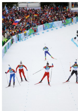
Vancouver 2010 Pursuit (M)