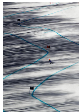
Sochi 2014 Super-G (W)