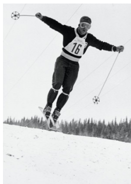
Oslo 1952 Downhill (M)