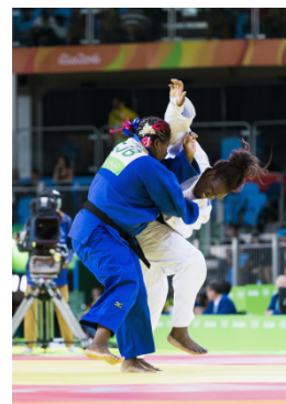
Rio 2016 Judo (W)