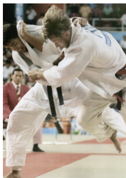
Barcelona 1992 Judo (M)