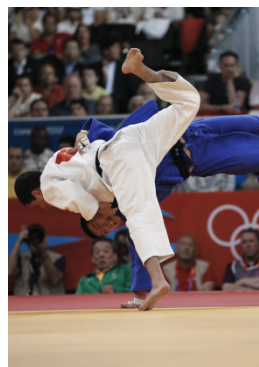
London 2012 Judo (M)