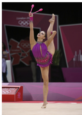
Beijing 2008 Individual all-around (W)