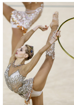
Rio 2016 Group competition (W)