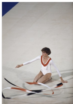
Los Angeles 1984 Individual all-around (W)