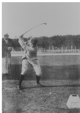
Paris 1900 Golf (M)