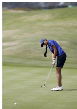
Rio 2016 Golf (W)