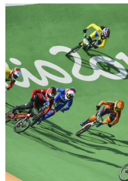
Rio 2016 BMX (W)