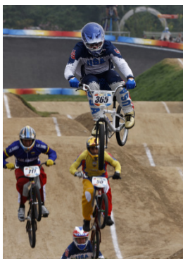
Beijing 2008 BMX (M)