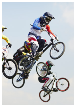
London 2012 BMX (W)