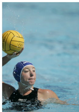
Athens 2004 Water polo (W)