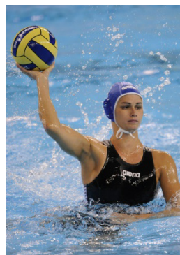
Beijing 2008 Water polo (W)