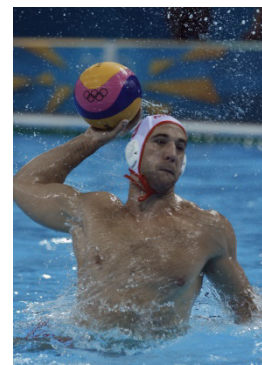
London 2012 Water polo (M)